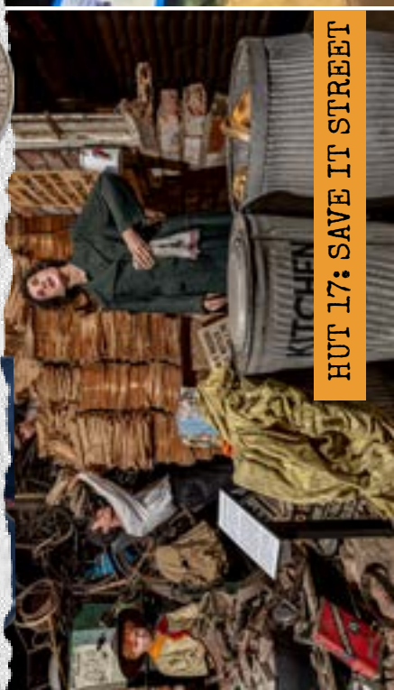
HUT 17: SAVE IT STREET