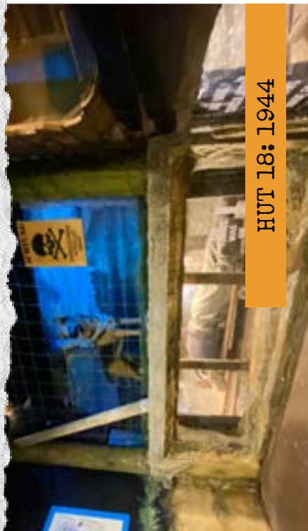
HUT 18: 1944